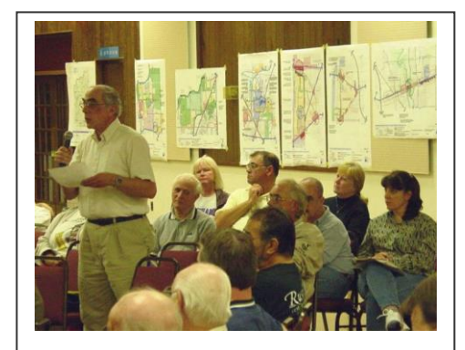
Residents comment on the Draft Plan at a Public Hearing.

In addition to the above components, the Town has maintained an active Comprehensive Plan website to further disseminate information and receive input on the Plan. Functions of the Comprehensive Plan website include: