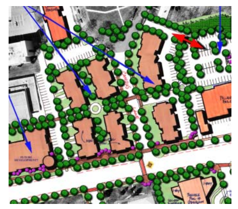
Potential infill housing on Campus Manor site to provide new housing option in area and potentially increase density.