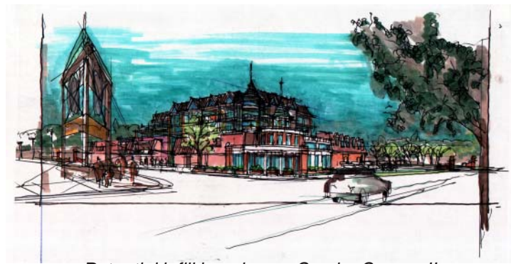
Potential infill housing on Snyder Square II site behind and above the existing shops and offices