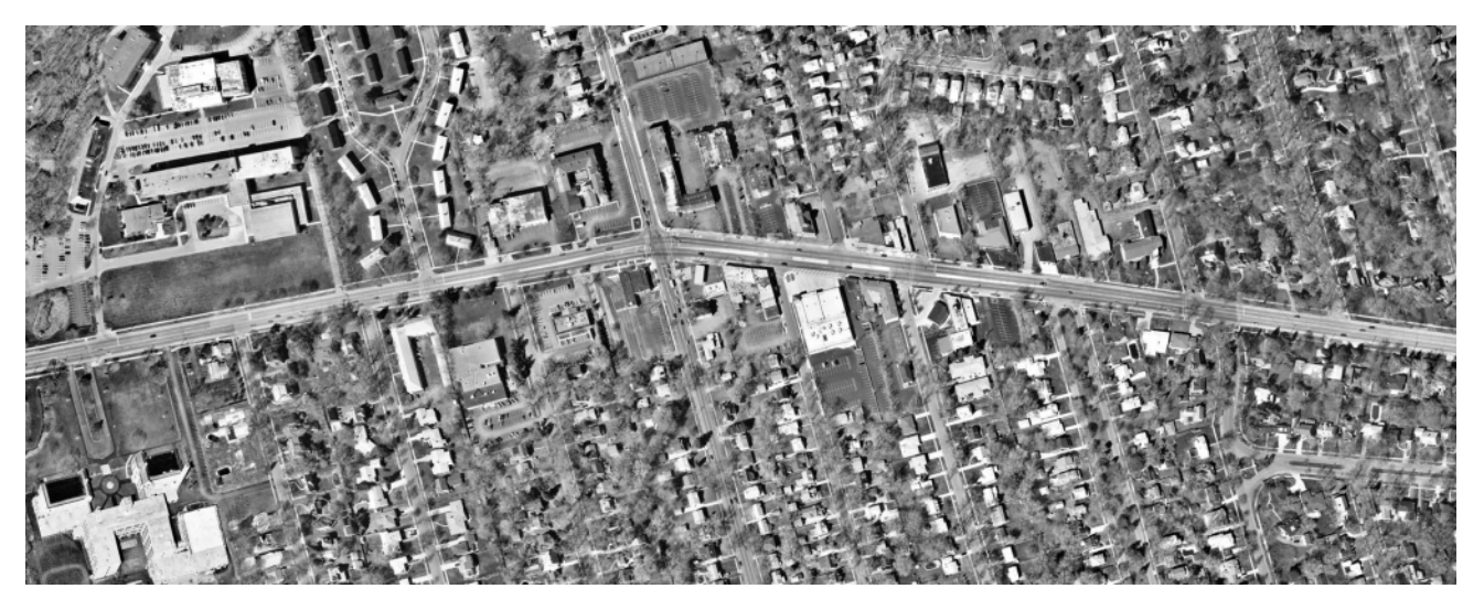
Existing Aerial View of the Snyder Business District