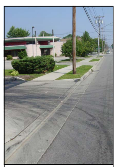
Traditional commercial areas require review and consideration of driveway consolidation and shared access to improve safety.