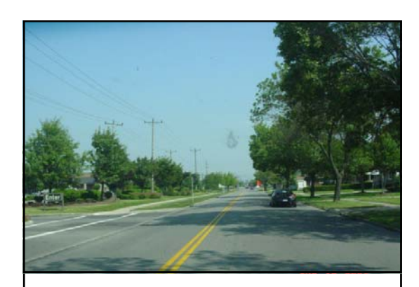
Commercial development with centralized access to Bailey Avenue and use of landscaped buffer to maintain Traditional and residential character. (South of Maple Road)