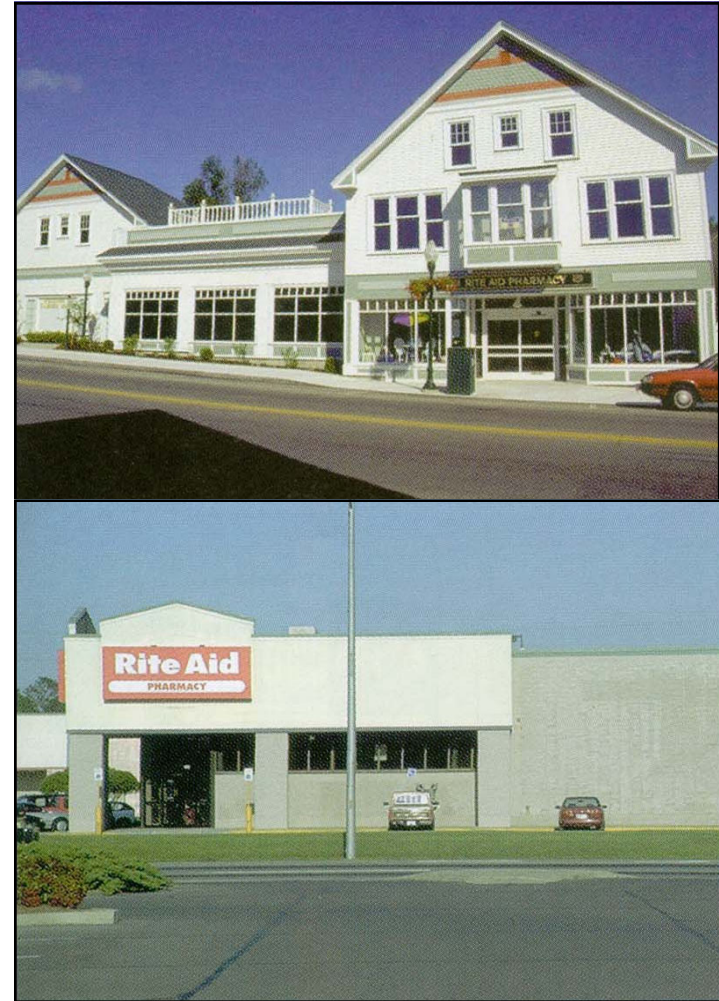
Figure II-2: Examples of the types of images used for the Preferred Development Survey, which allowed participants to identify favorable development for the Transit Road corridor. The top image was given a favorable rating and the bottom image was rated

During the process, a series of stakeholder meetings were conducted to ensure that the concerns and issues of specific groups, such as residents, businesses, elected officials, and emergency services, were heard. These meetings were held in order to identify a