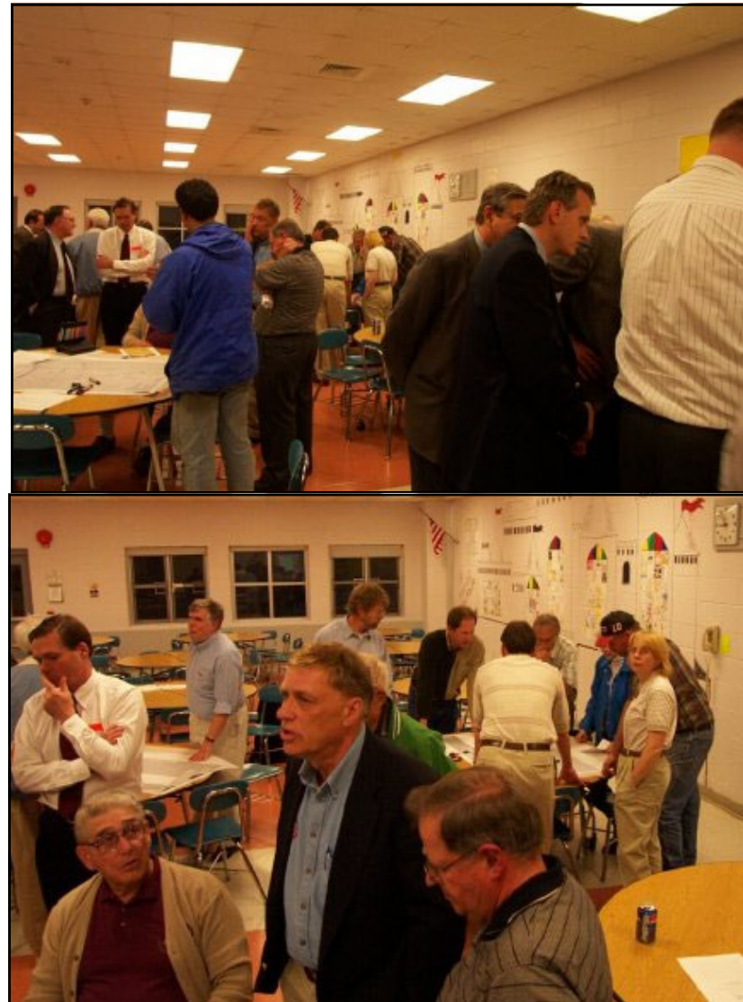
Figure II-1: Transit Road Public Meeting held in March 2002.

The report also contains recommendations for highway improvements such as medians, auxiliary turn lanes, median openings, future intersections, frontage/access roads, pedestrian accommodations, and local road improvements. Sketch plans that illustrate recommendations for improved access to existing businesses have also been produced for the developed portions of the corridor.