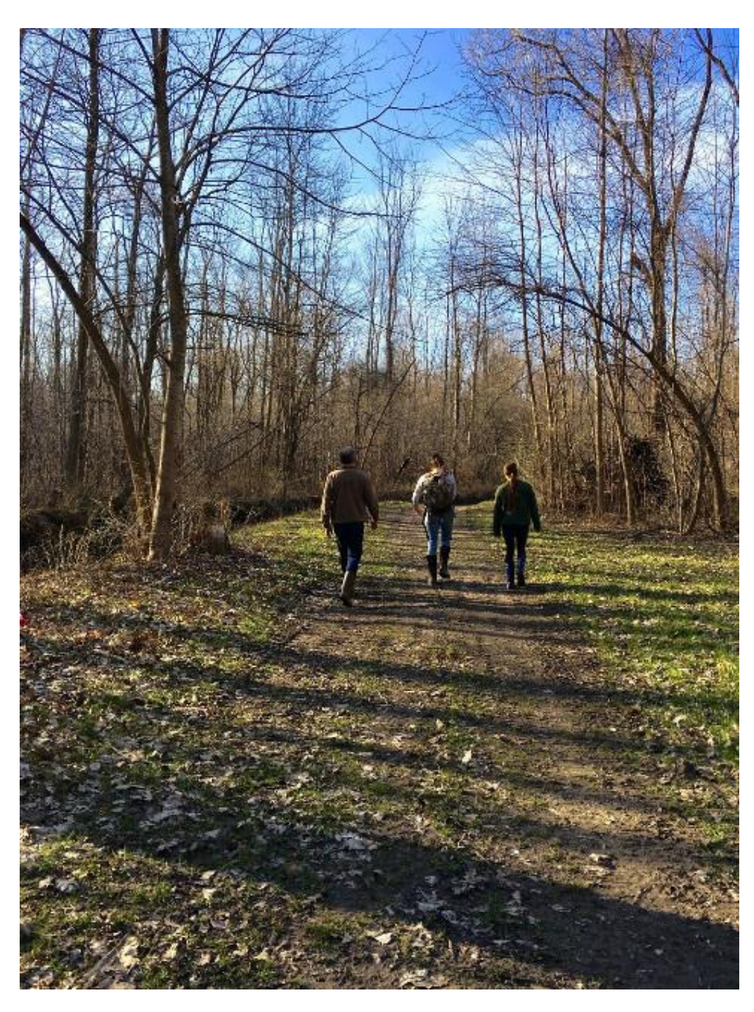
The sun welcomes visitors on a beautiful spring day.