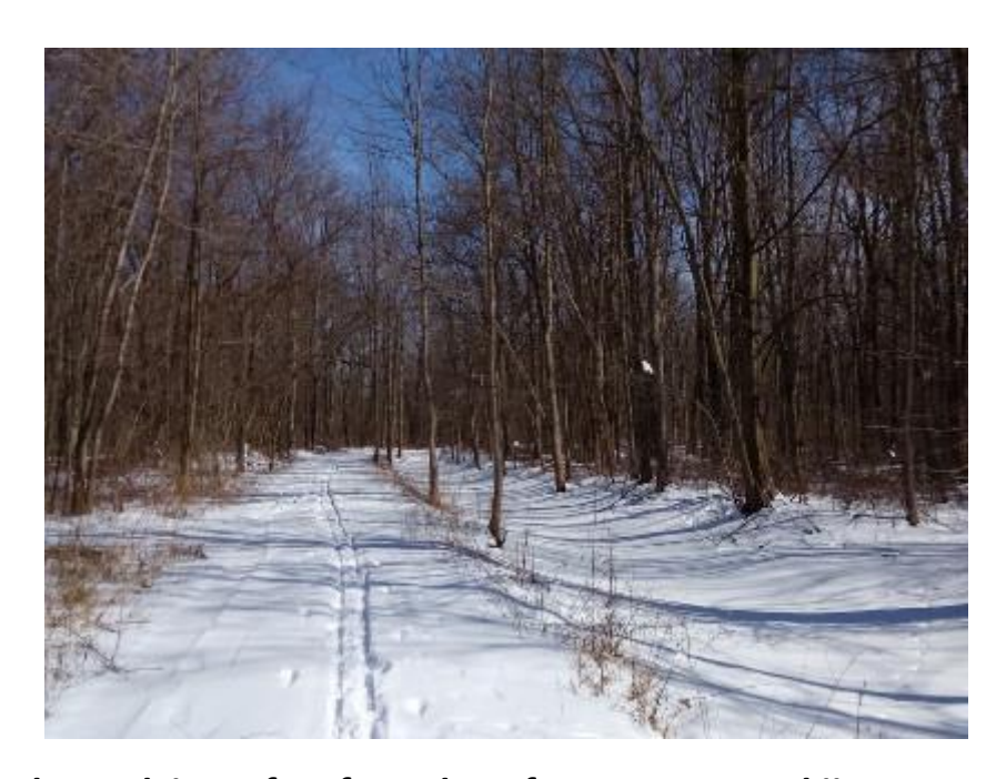
In winter, the park is perfect for a day of cross-country skiing or snowshoeing.