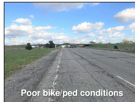
Poor bike/ped conditions

of sidewalk will be installed and connected to shoulders to ensure full pedestrian access is provided within the entire corridor. More significant pavement reconstruction work will be included at the east approach of