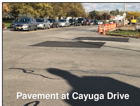
Pavement at Cayuga Drive

Traffic will be maintained on-site with daily lane closures and/or the use of flag persons or temporary signals to control alternating one-way traffic. There should be minimal delays to motorists. At the end of each working day,