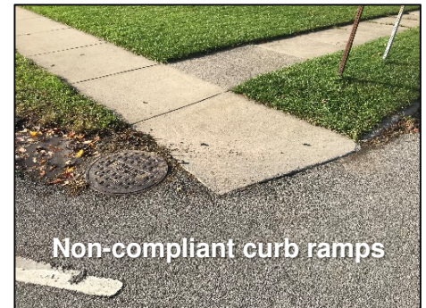
Non-compliant curb ramps

The project will primarily consist of pavement resurfacing within this segment, with minor improvements to the drainage system and upgrading sidewalk ramps to meet ADA guidelines. A minimum 4-foot shoulder will be provided along the entire segment to provide increased accessibility for pedestrians and bicyclists. This will require widening the shoulders on the section between Cayuga Drive and Aero Drive. Some areas